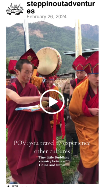
4 likes steppinoutadventures Discover the enchanting beauty of Bhutan by booking a trip with Steppin out and not straining your wallet! If you book with us by end of February you get $300 off plus the bonus of paying monthly inst...

Do you know that we have tons of videos/reals photos on our social media platforms? And we post a lot more often than this monthly newsletter. Check out some of the ones below and join our feeds/platforms and help us increase our visibility.